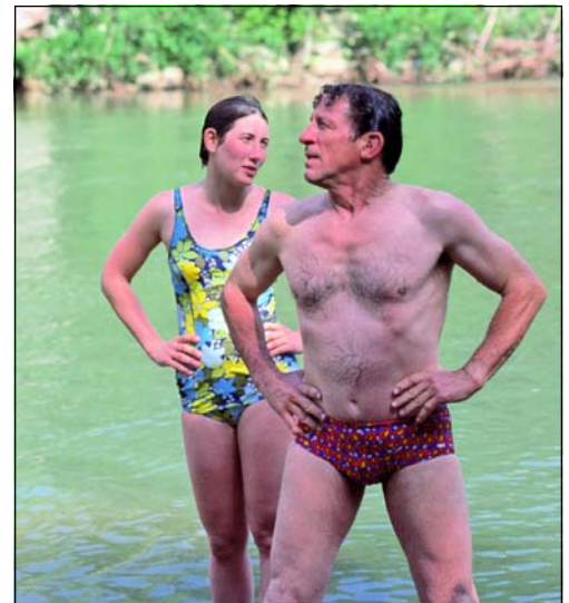
Missouri 1970's.