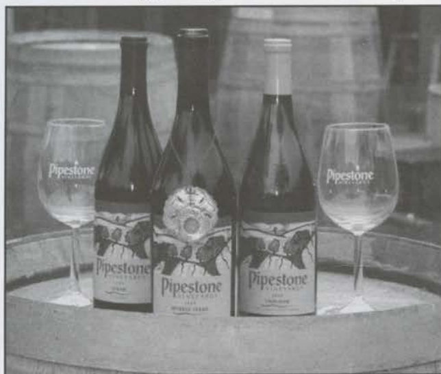
A touch of class from the Pipestone Vineyard.