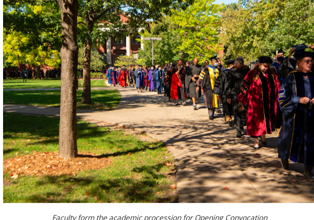
Faculty form the academic procession for Opening Convocation