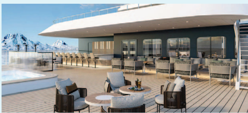
Café/Bar with swimming pool

Currently under construction in Finland, and scheduled to be delivered in October 2021, Swan Hellenic's Minerva is a new-generation expedition cruise ship. Although at 10,500 tons the ship is large enough to accommodate more than 250 passengers, Minerva will accommodate a maximum of 152 guests in 76 spacious staterooms and balcony suites. The low guest density results in one of the most generous indoor and outdoor space-to-guest ratios among cruise ships.