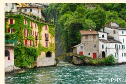
Photos: Top, Santa Maria di Piona Abbey; Middle, Lake Como Ferry; Bottom, a lagoon on Lake Como