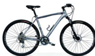
Turro 20-speed bicycle (included in tour pricing)