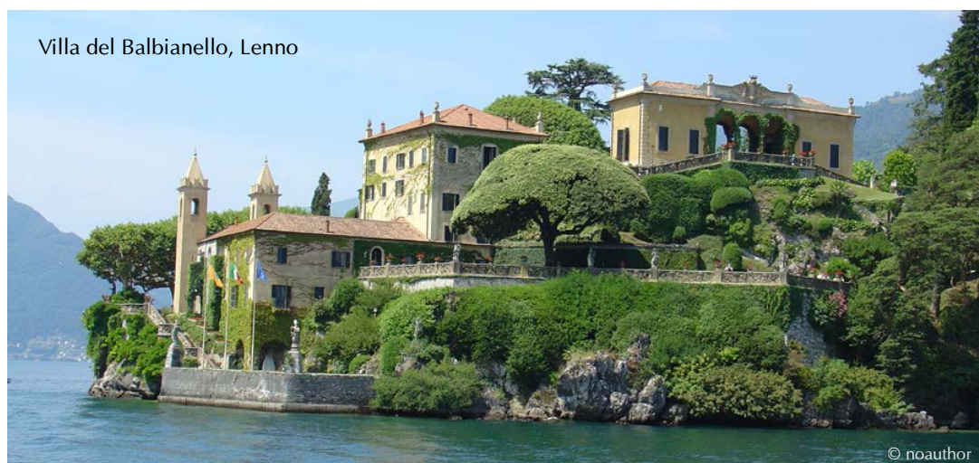
Villa del Balbianello, Lenno

Airfare from/to home is not included. Individual transfers are included on your arrival to and departure from Milan Malpensa Airport (MXP). Your flight itinerary must be provided to our office prior to the tour. Once you have received your final payment invoice, you should book your flights. If you are considering booking non-refundable airline tickets before this time, please contact our office first. We do not accept any liability for cancellation penalties related to domestic or international airline tickets.