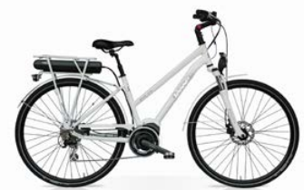
Turro electric bicycle (additional fee)