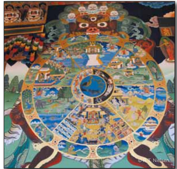
Above, the Buddhist thangka painting “The Wheel of Life,” Punakha. Below and bottom right, Buddhist traditions and monasteries are active throughout Bhutan. Bottom left, traditional bridge still in use.

© Copyright 2017 Eos Study Tours. All rights reserved.