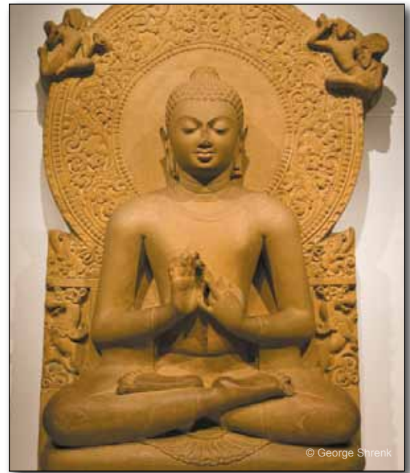
Above, Buddha sculpture at the Sarnath Museum, India. Below, Sadhu (holy person) in Varanasi. Bottom, prayer wheels, Thimphu.