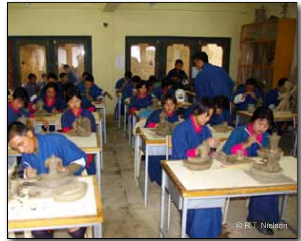
Above, an art school in Thimphu, Bhutan. Below, a thangka painting in Punakha. Bottom, the Punakha Dzong.

After a morning meditation session and breakfast, we drive to the village of Nezigang to take a walk through cultivated fields and hamlets and visit an elaborate shrine recently built by the royal family, the Khamsum Yuley Namgay Chorten , which has superb views of the Punakha Valley. The walk to the shrine takes about 2½ hours along a broad but uphill trail. Descend and follow ancient riverside trails amid whitewashed farmhouses (this is about an hour's walk back to the motorcoach). Later, visit the massive, 17 th -century Punakha Dzong , built at the confluence of the Mo Chu and Pho Chu (Mother and Father Rivers). This vast, labyrinthine dzong played a pivotal role in Bhutan's history, and today it serves as the winter home of Je Khenpo, the head abbot of Bhutan, who resides there with a retinue of 1,000 monks. (B,L,D)