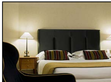
Hotel dei Mellini