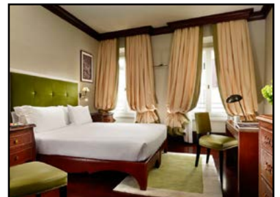
Hotel L'Orologio Firenze