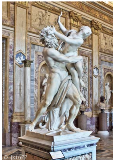
Rape of Proserpina by Bernini at the Borghese Gallery, Rome

Visit the Borghese Gallery, housed in a splendid, 17 th -century villa with an exceptional art collection, including sculptures by Canova and Bernini plus paintings by Titian, Raphael, and Caravaggio. Enjoy a final Roman lunch before we board a Frecciarossa high-speed train (1.5 hours) to Florence (Firenze). Gather at our hotel for a lecture and discussion, and then dinner and the evening are at leisure. Overnight at the 4-star Hotel L'Orologio Firenze for five nights. (B,L)