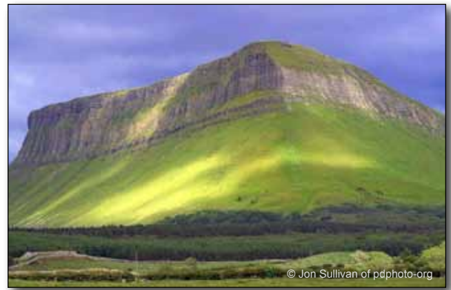
Above, Ben Bulbin, in County Sligo. Below, the ancient monastery of Clonmacnoise, with the river Shannon in the distance. Bottom, Thoor Ballylee Castle, also known as Yeats' Tower.

After breakfast, a group transfer takes us to Dublin airport for independent flights homeward. (B)