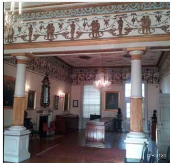
Above, the Dublin Writers Museum. Below, the Giant's Causeway, a UNESCO World Heritage site, Northern Ireland. Bottom, the grounds of Kylemore Abbey. Opposite, the Connemara region.

Departing Belfast, we drive west towards County Sligo, known as Yeats' Country . On the way, stop in Bellaghy to visit the Seamus Heaney HomePlace , an arts and literary center that celebrates the late Poet and Nobel Laureate Seamus Heaney with an interactive exhibition of artifacts, photos, videos, and more. After lunch, we continue on to the west coast of Ireland, where we check-in to our hotel in the heart of Sligo town. The evening is at leisure. Overnight at the Clayton Hotel Sligo for two nights. (B,L)