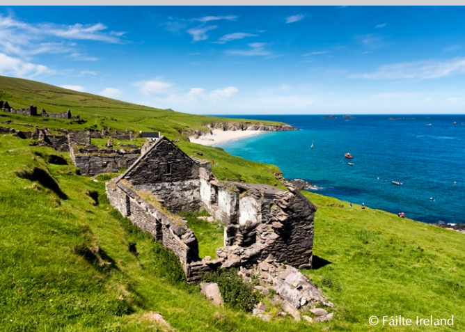
Ruins on the Great Blasket Island