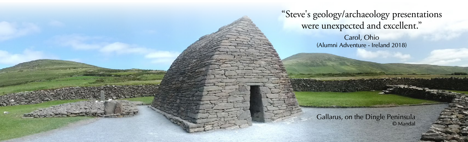
Gallarus, on the Dingle Peninsula

Carol, Ohio (Alumni Adventure - Ireland 2018)