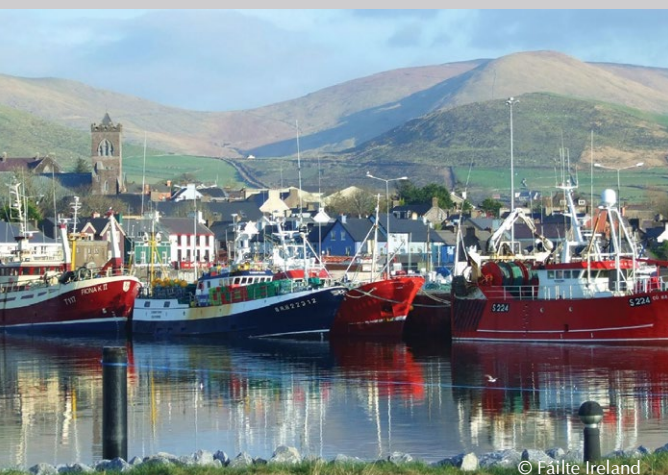
Marina on the Southern Peninsula, Dingle