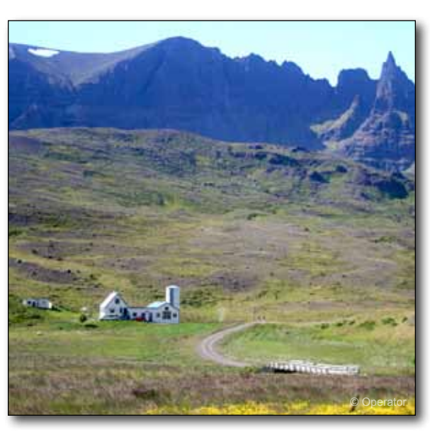
Above, a view from the Tröllaskagi Peninsula. Below, the Eyjafjörthur fjord.

Those departing on the suggested flight will be transferred as a group from Reykjavík to Keflavík International Airport (KEF) for flights homeward. (B)