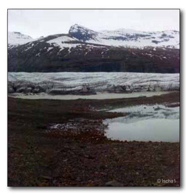
Above, a glacier in Vatnajökull National Park. Below, Seljalandsfoss waterfall. Bottom, a thermal pool at Hveravellir.

Today, explore the mountainous Tröllaskagi Peninsula, which has the highest peaks outside the central highlands. Drive along scenic Eyjafjörthur fjord, through the fishing villages of Dalvík and Ólafsfjörthur, with superb views (and perhaps some bird watching) along the way. A new tunnel takes us to Siglufjörthur, an idyllic fishing village barely 24 miles from the Arctic Circle. From 1900 to 1970, Siglufjörthur was the herring capital of the North Atlantic, but today is a quiet home to 1,500 people and we will visit its herring museum with an option to also visit