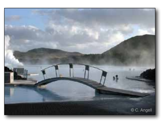
Above and below, the Blue Lagoon, a "natural" geothermal pool in Reykjavík. Bottom, the Gullfoss waterfall.

This morning we visit Thingvellir, the old parliament site where the national assembly was founded in A.D. 930 (and continued until the late 1800s, when it moved indoors to Reyjkavík). Thingvellir is also a place of geological interest, where the continental plates of North America and Europe come to the surface. Continue on to Skálholt Church, built on the site where southern Iceland's first bishopric was founded in the 11th century. Visit a greenhouse called Friðheimar, located in Reykholt, where tomatoes are grown year-round despite Iceland's long, dark winters. After lunch, including a taste of the crop, we continue our drive to the geothermal fields of Geysir for a walk around the hot springs. Nearby is Gullfoss waterfall, which travels 18 miles from the glacier Langjökull in the north to fall more than 100 feet into the canyon of Hvítá. Drive to the town of Hella, where we check-in to our hotel and have dinner. Overnight at Stracta Hotel Hella for five nights . (B,L,D)