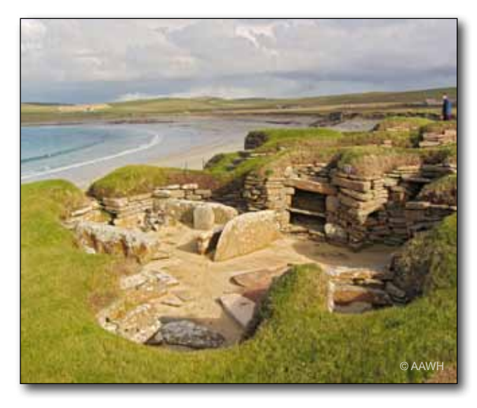
Above, Skara Brae, where the original village dates back to 2450 B.C. Below, the Ring of Brodgar, a stone circle that is 341 ft. in diameter, is the third largest in the British Isles.