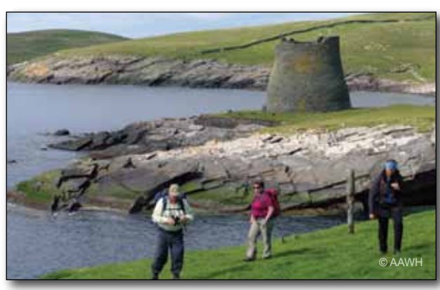
Above, hikers traversing the Isle of Mousa. Below, Hermaness on the Isle of Unst, Shetland.