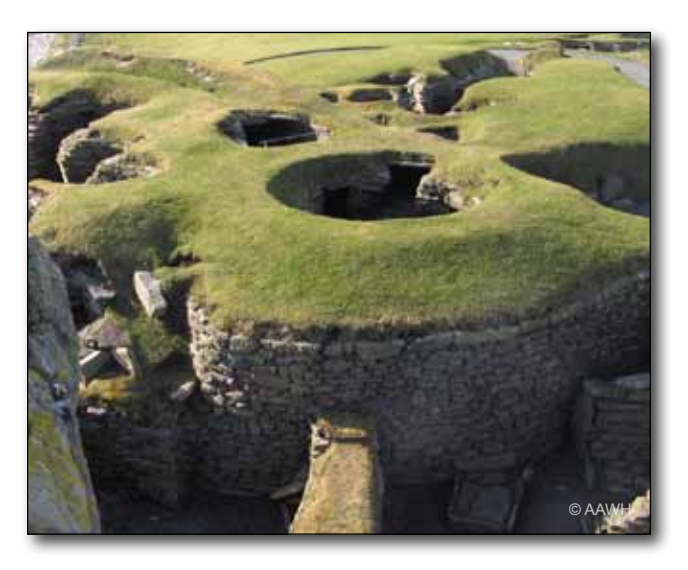
Above, the archaeological site of Jarlshof, dating back to 2500 B.C. Below, a view of the Atlantic from the northern Shetland island of Unst. Bottom, Old Red Sandstone, the building blocks for most of the archaeological monuments on Orkney.