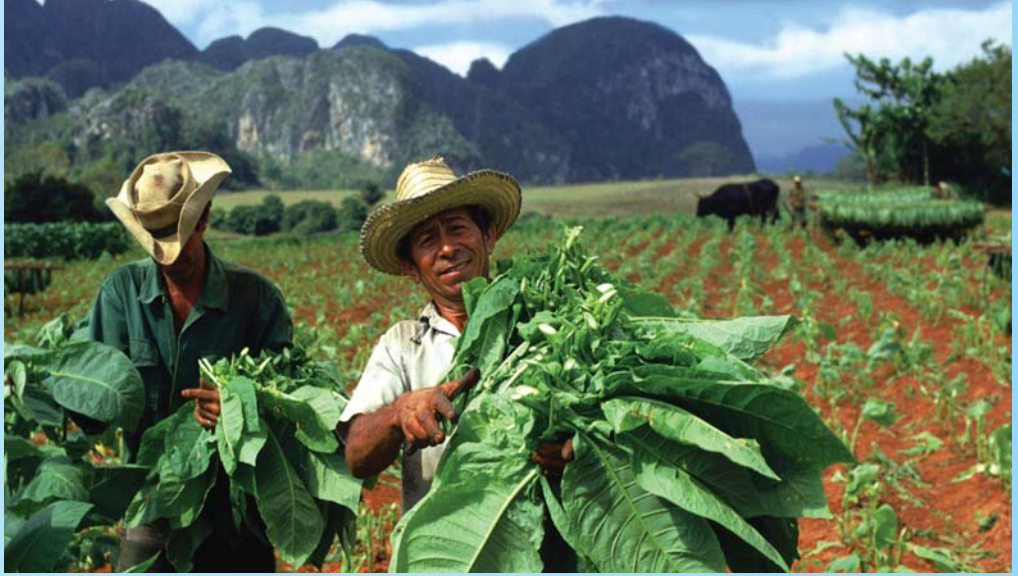
Farmers grow much of the world's premium cigar tobacco in the fertile Viñales Valley, a UNESCO World Heritage site, in the agricultural province of Pinar del Río.