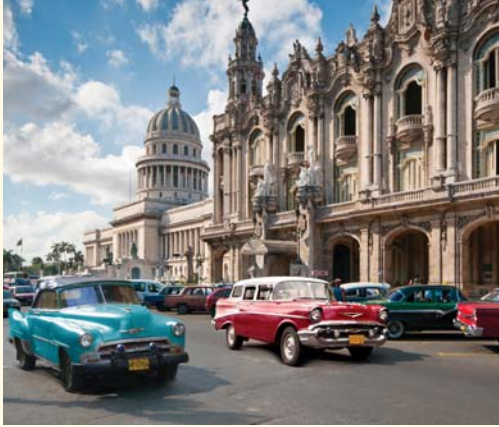
The streets of Cuba are a treasure trove of American classic cars lovingly and innovatively restored.