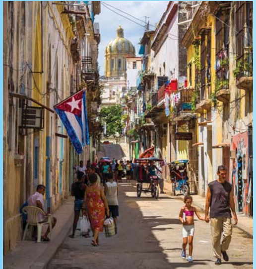
Lively Brasil Street in Old Havana.

Castillo San Pedro de la Roca (El Morro), a UNESCO World Heritage site, was built in the 17 th century to protect Santiago de Cuba Bay.