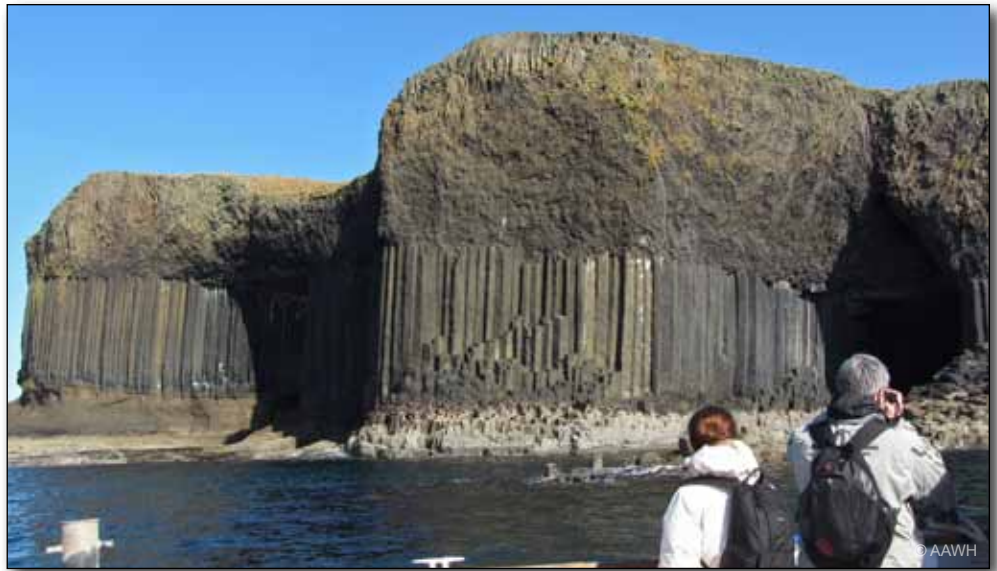
Above, Fingal's Cave, Isle of Staffa. Below (1), Talisker Distillery, Isle of Skye. Below (2), Cuillin mountain ridge view from Elgol. Bottom, Loch Coruisk.

Today we will visit two islands off the coast of Mull: Staffa and Iona. The beautiful, uninhabited island of Staffa is our first stop, and best known for its magnificent basalt columns. Their effect is most overwhelming at An Uamh Binn (musical cave) or, as it is more commonly known, Fingal's Cave, which is scientifically among the lowest strata of Mull's stepped landscape of lava flows and was artistically the inspiration for Mendelssohn's 'Hebrides Overture.' From Staffa we cruise to Iona, an enduring symbol of Christianity in Scotland. St. Columba and his followers came here from Ireland in A.D. 563 and founded a monastery that became the heart of the early Scottish Church. St. Columba's fame attracted pilgrims to Iona from the 7 th century onwards. The island also served as a burial ground for important and holy people, including kings of Scotland (among them Macbeth, who died in A.D. 1057). Iona's rocks are mainly ancient Lewisian gneisses of igneous origin, but there is also an important band of marble from which the Abbey's communion table was carved. The Sound of Iona hides the southern extension of the Moine thrust fault, itself explaining Iona's difference from Mull. (B,L,D)