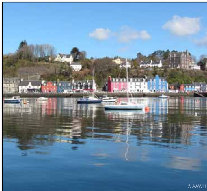
Above, Tobermory harbor. Below, Calgary Bay, Isle of Mull.

Our itinerary progresses from the south (Isle of Mull) to the north (Isle of Lewis).