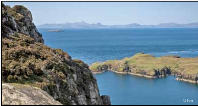
View from the Isle of Skye

The weather in July can vary from proper summer conditions to something much cooler, windier, and wetter, then back again within a week (or within a day). A daytime maximum of approximately 60-70°F will be as good as we can expect. Nighttime temperatures will usually drop to around 50°F. It's usually mild, but you need to be prepared with clothes to cover cool and warm weather, not to mention rain. Even in July we could have chilly weather on exposed and breezy coasts. The high latitude of Scotland means that the days will be long with an extended twilight.