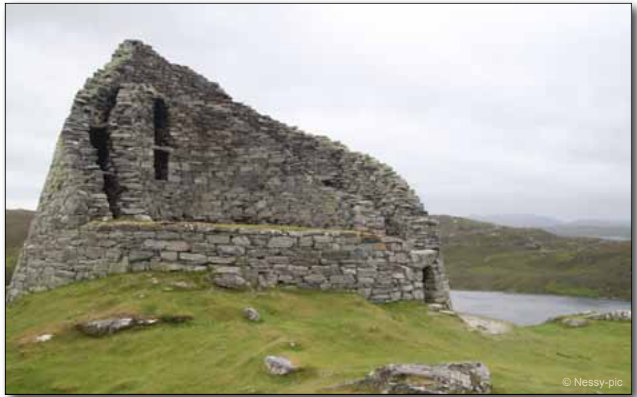
Above, Dun Carloway Broch, Isle of Lewis. Below, Standing Stones of Callanish, Isle of Lewis. Bottom, the blackhouse village of Gearrannan, also on the Isle of Lewis.

The rocks of South Harris, as with most of the Outer Hebrides, largely consist of Lewisian gneisses dating from as many as three billion years ago, and we can see a variety of them as we walk along the attractive west coast. Continue across the sands and machair of Losgaintir (Luskentyre) and across calcareous grassland to acid moorland. (Machair is fertile, well-drained grassland formed by sand being blown over the peat.) Return along the winding 'Golden Road' that follows the east coast northwards and provides superb views across the 'knock and lochan' terrain. (B,L,D)