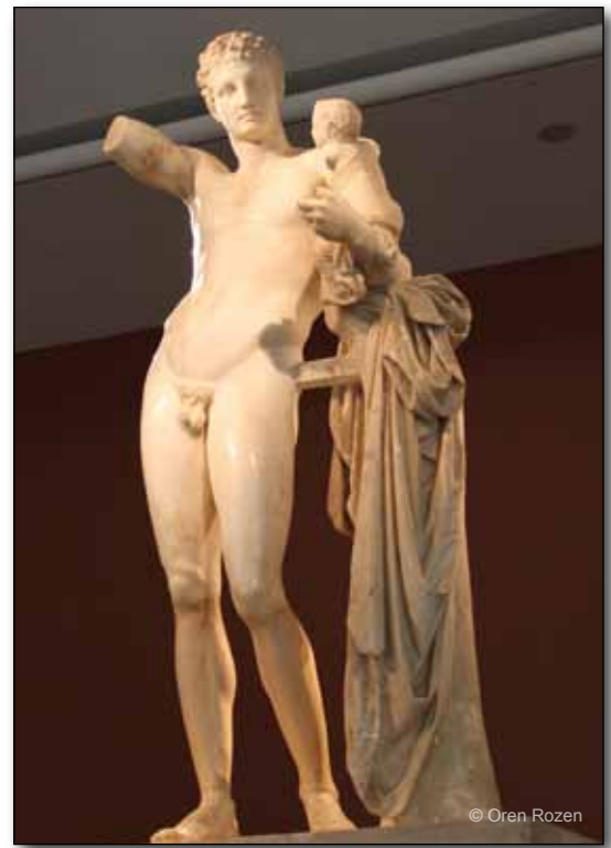
Above, Hermes bearing the child Dionysos, Archaeological Museum of Olympia. Below (1), the gymnasium at Olympia. Below (2), The Temple of Apollo, Corinth. Bottom, the theater at Epidaurus.

Transfers are provided to Athens' international airport for flights homeward. Or, stay on for the optional extension. (B)