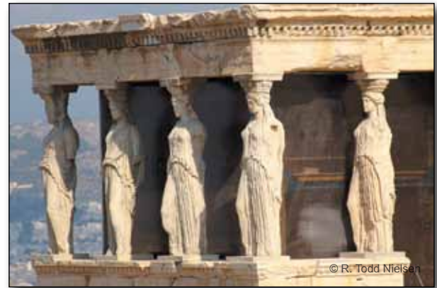
Above, the Erechtheion, Acropolis, Athens. Below, the Odeon of Herodes Atticus, located on the southwest slope of the Acropolis, Athens. Bottom, the Tholos at the sanctuary of Athena Pronoia, Delphi.