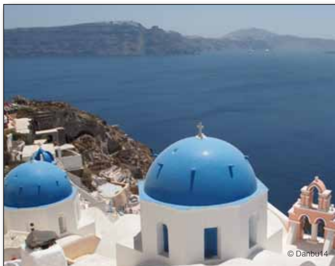
Above, the island of Santorini. Below (1), the archaeological site of Akrotiri, Santorini Below (2), the island of Mykonos. Bottom, the Terrace of the Lions, Delos.

Take a group flight to Athens and connect with flights homeward.