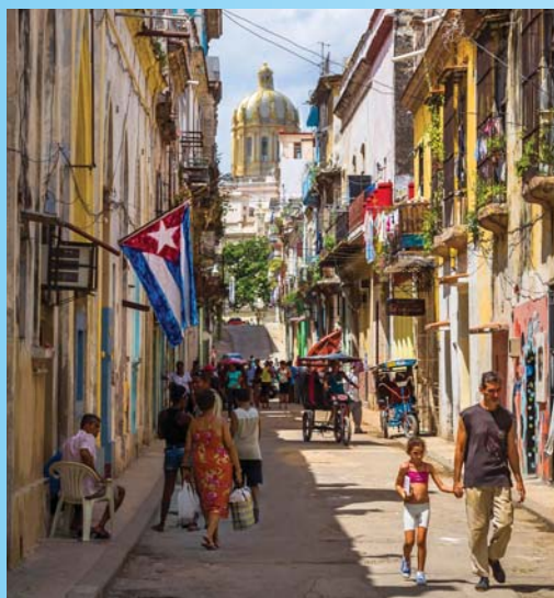
Lively Brasil Street in Old Havana.

Cuba's second largest city is perhaps the island's most vibrant and culturally rich, with its lively music and attractive colonial architecture.