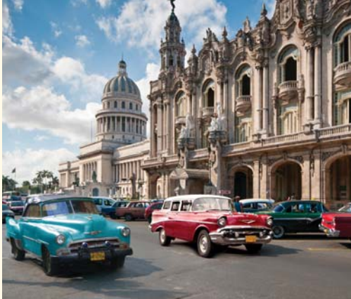
The streets of Cuba are a treasure trove of American classic cars lovingly and innovatively restored.