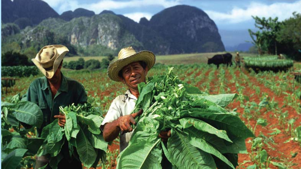
Farmers grow much of the world’s premium cigar tobacco in the fertile Viñales Valley, a UNESCO World Heritage site, in the agricultural province of Pinar del Río.

Cuba’s capital, the early-20 th -century “Paris of the Caribbean,” remains arguably one of a kind, mixing impressive urban architecture and culture with an earthy, informal vibe and a lively arts and music scene, while retaining a distinctly vintage feel bolstered by the prevalence of 1950s American-made automobiles fondly called “Yank tanks” by the locals who painstakingly maintain them.