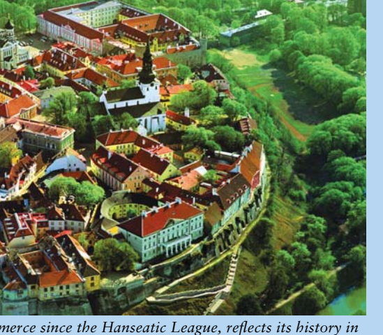
that define its picturesque skyline.

Enjoy a guided tour of the splendid parklands and extravagant Grand Palace of Petrodvorets, a UNESCO World Heritage site, commissioned by Peter the Great to rival the Palace of Versailles. The elaborately landscaped grounds feature magnificent formal gardens and cascading fountains. Return to St. Petersburg by hydrofoil, skimming over the Gulf of Finland.