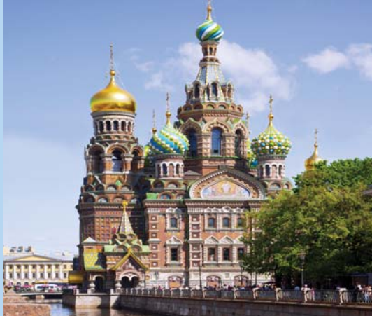
St. Petersburg's Church of the Resurrection of Christ is a dazzling showcase of neo-medieval Russian architecture.

Be on deck as you cruise through the scenic Stockholm archipelago, the gateway to the magnificent "Venice of the North." Disembark and continue on to explore the historic splendor and dramatic beauty of Stockholm on the Post-Cruise Option or depart for the U.S.