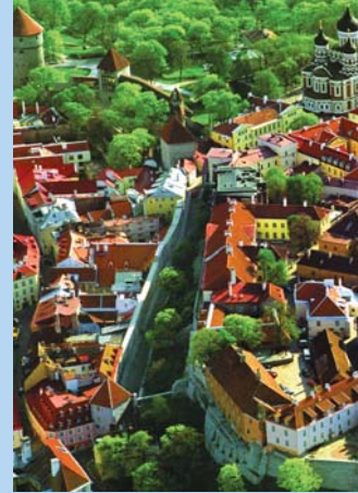
Tallinn, a hub of culture and comthe 600-year-old spires and gables