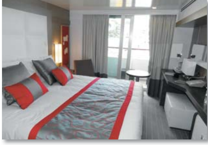
Stateroom with Balcony

In keeping with the low passenger density relative to the ship's size, the public areas are spacious and inviting and can accommodate all passengers comfortably. Enjoy views from the Panoramic Lounge, nightly entertainment in the Main Lounge and lectures, cultural performances and film screenings in the state-of-the-art theater. There is a library, Internet suite, Sun Deck, swimming pool, beauty salon, spa, Turkish bath-style steam room, full range of fitness equipment and two elevators. The infirmary is staffed with a doctor and nurse. The highly trained international crew provides personable and attentive service.