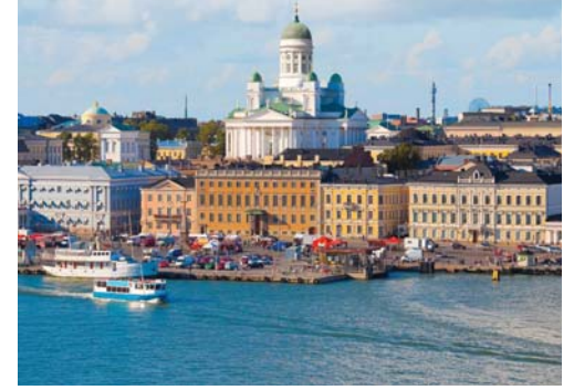
Finland's waterfront capital city of Helsinki showcases elegant Jugendstil architecture along its picturesque harbor.