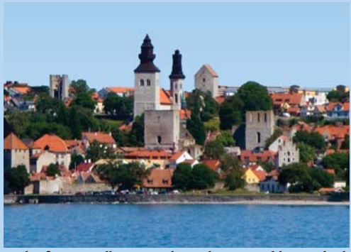
Visby flaunts well-preserved warehouses and houses built by wealthy merchants during centuries of prosperous trade.

In 1980, workers led by Lech Wałęsa founded the Solidarity movement, the first independent trade union in Eastern Europe and the key factor in winning the Polish struggle against Communism. Visit the historic Lenin Shipyard, where the movement began, and its Monument to the Fallen Shipyard Workers. Enjoy time to explore Gdańsk's lovely Old Town at your own pace.