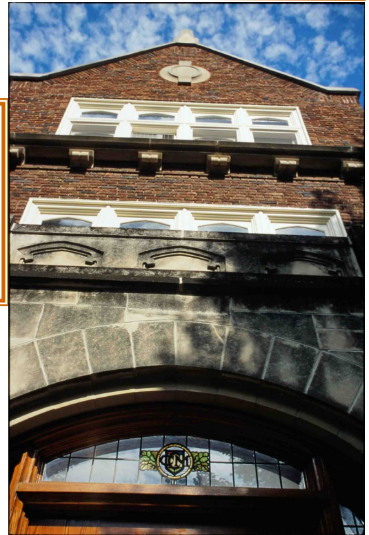
Old Music Hall, third floor, is the temporary location for the Grants Office: Rooms 308, 311, 319

upon receiving, from the Grants Office, a draft of a required proposal component