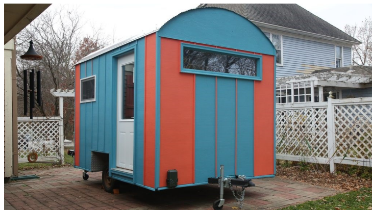
The Wandering House:

Refer to the Proposal Checklist and the Call for Proposals page.