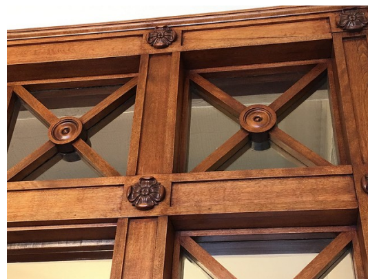
Symmetry in Laird Hall, not far from CFR office doors